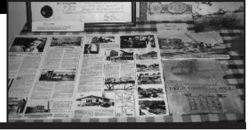
EXHIBIT RENOVATION PROGRESS REPORT