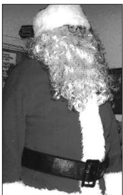
A Stop from Santa!